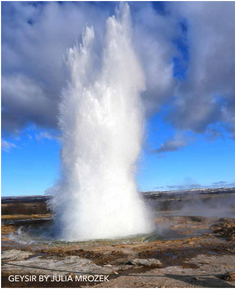
GEYSIR