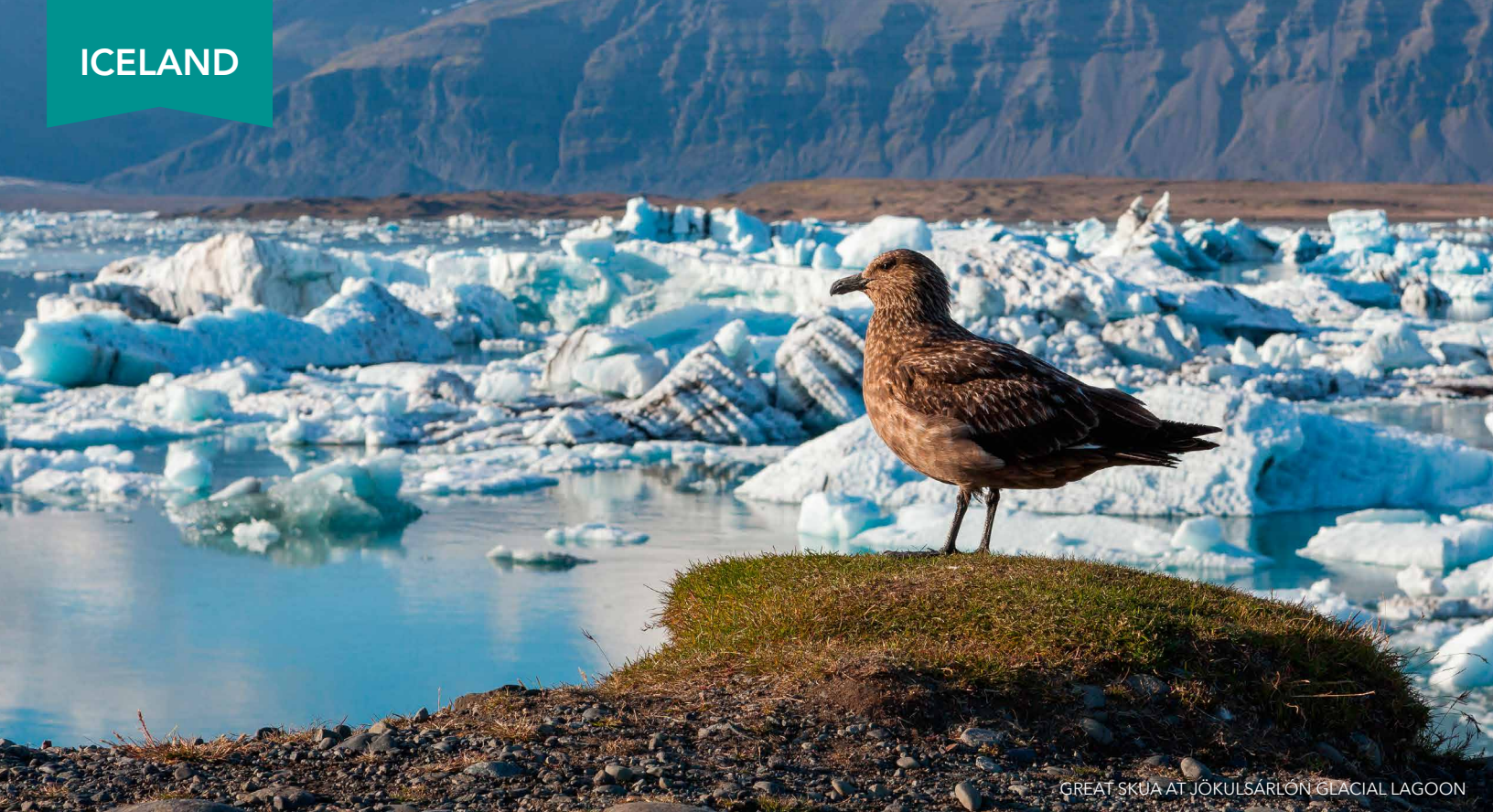
GREAT SKUA AT JÖKULSÁRLÓN GLACIAL LAGOON