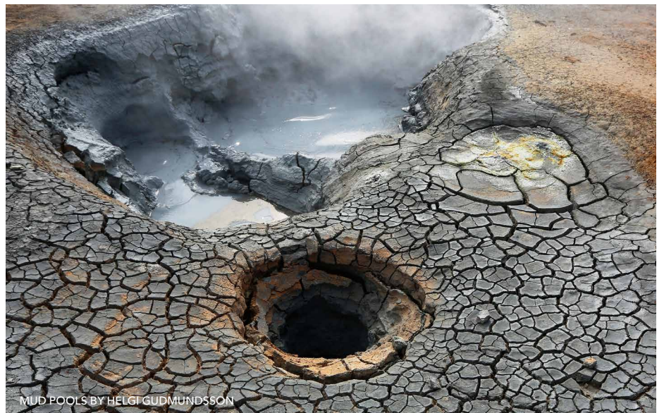
MUD POOLS BY HELGI GUDMUNDSSON