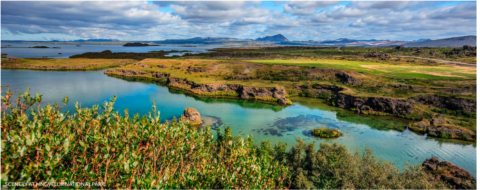
SCENERY AT PINGVELLIR NATIONAL PARK